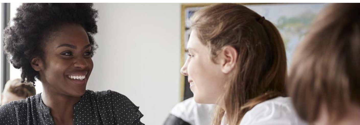
Image description: woman and young person smile at each other in a classroom setting.