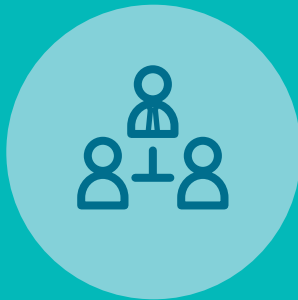
Encounters with employers and employees

We are particularly interested in ways in which we can bring the worlds of education and employment closer together. So last year we commissioned Deloitte to examine the range of activities that schools could use to support these encounters with the world of work. 14