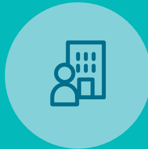
Experiences of the workplace

Many of the stakeholders interviewed as part of this research believed that all of these activities were valuable and that they should form part of school's careers and enterprise programmes.